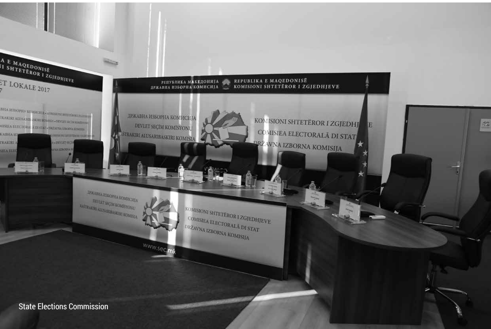
State Elections Commission