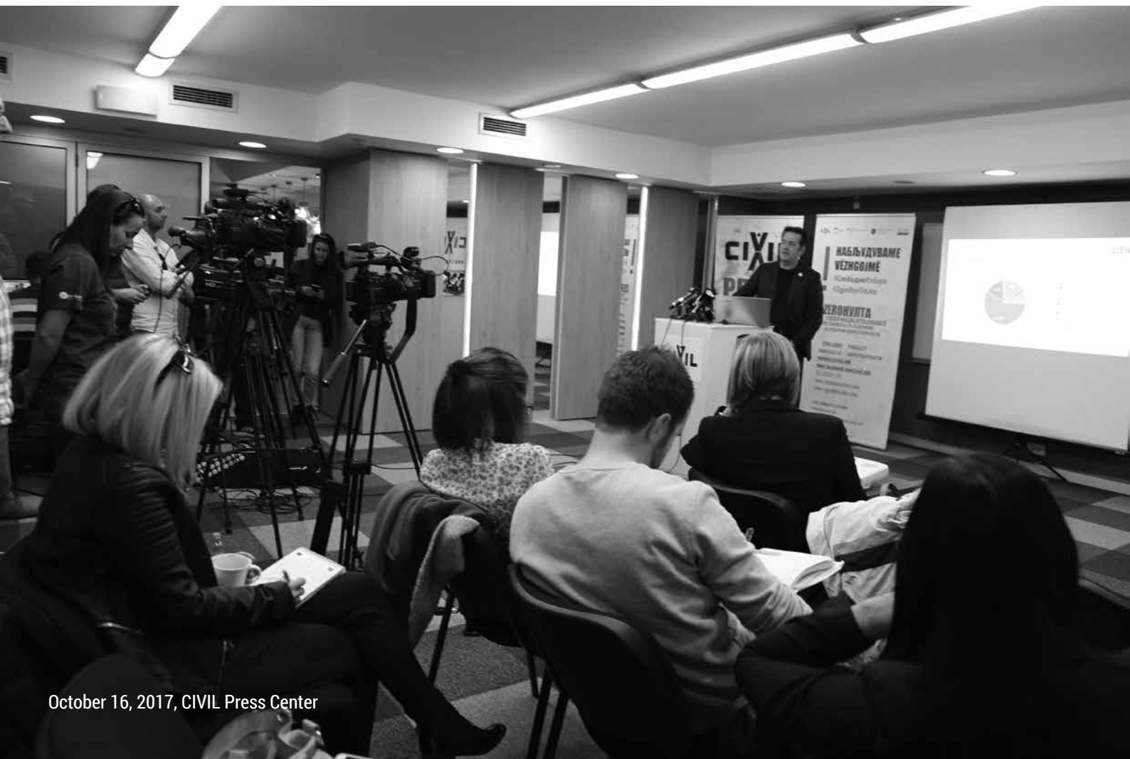
October 16, 2017, CIVIL Press Center